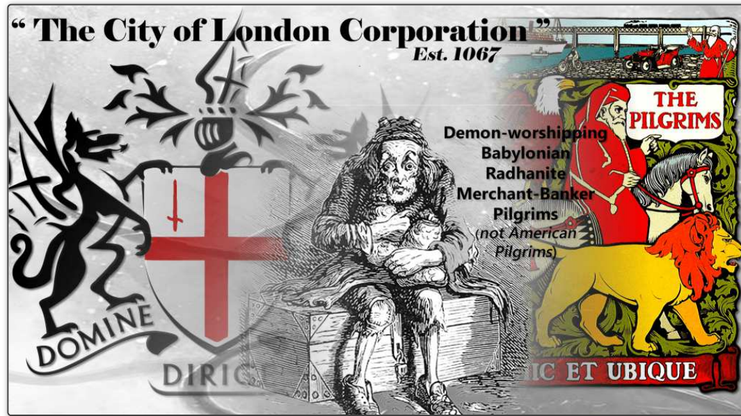
Fig. 8 —The City of London is controlled by the Pilgrims Society who carry on the pagan control of the Rādhānite merchant-bankers of Babylon. "The City of London Corporation" was chartered in 1067 after the coronation of William I, William the Conqueror, on Dec. 25, 1066 AD at Westminster Abbey.

Don't believe that the British run America? Just look at the false flag they are trying to orchestrate in Poland right now. Poland is historically one of the favorite choke points of the British Empire to try and take down Russia to seize control of Russia's 11 times zones of resources, again. When will we learn?