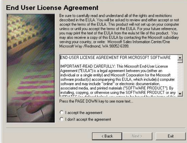
Fig. 2 - Sample End-User License Agreement presented to users prior to the installation of a new software package. The design of these screens has changed with the advent of web site coding, but the underlying verbiage has only become more deceptive.

Lawyers are the least trusted profession for a reason: they ultimately work for British, not American interests as will be shown.